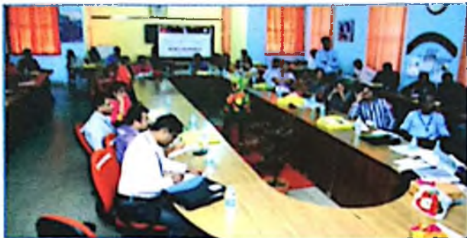
Interaction of participants with the resource faculty during the workshop