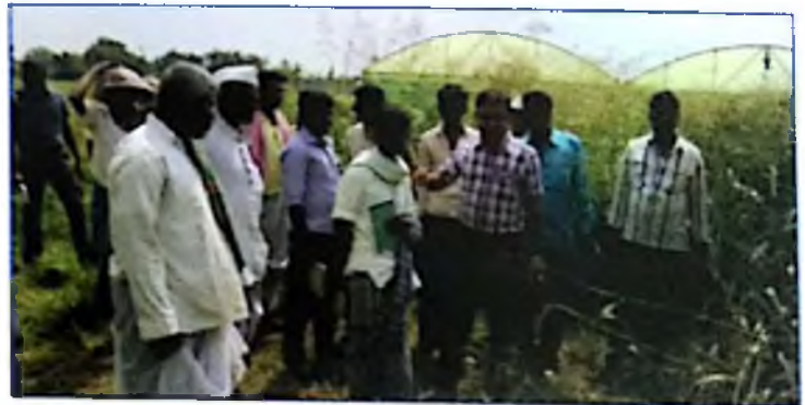
Fodder Plot Demonstration