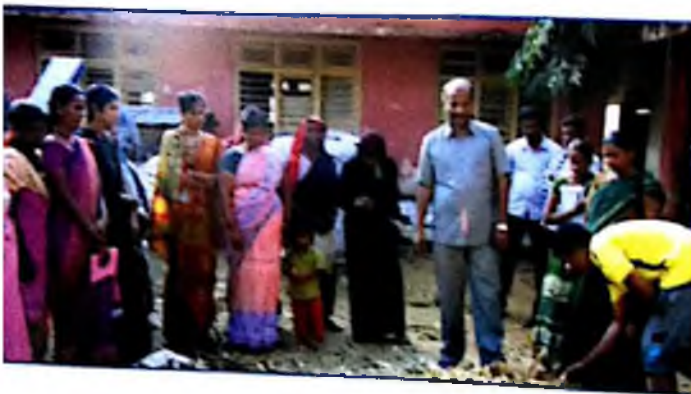
Training Fodder enrichment Demo