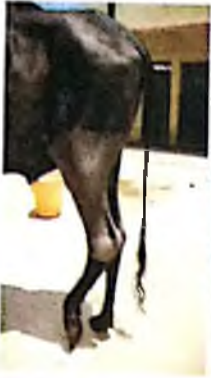
Tibial fracture, non-weight bearing in a cow