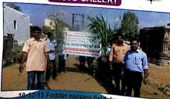
10-12-15 Fodder nursery field day at Menasgi