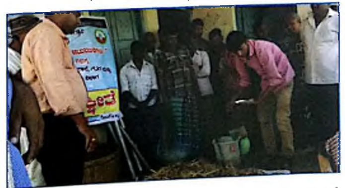
Demonstration of dry fodder enrichment Gadagol