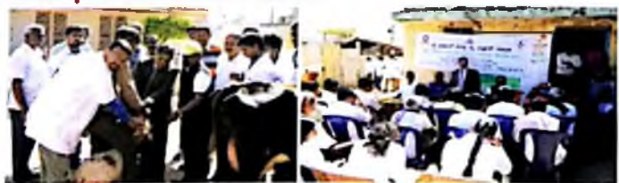
Jai Kissan Jai Vignan week animal health and fertility camp at Yeliyuru adopted village of Veterinary College Bengaluru