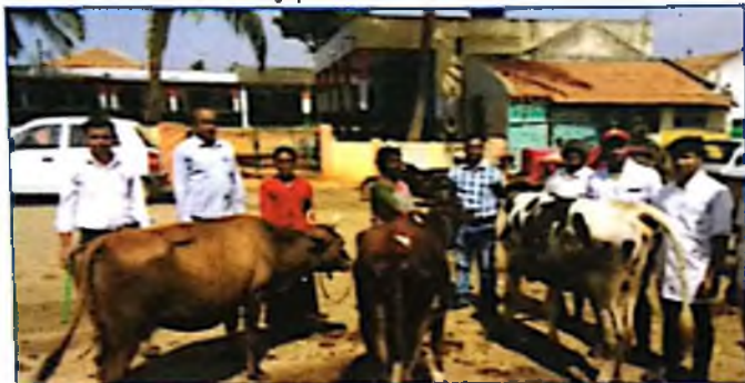
Demonstrating CIDR and Ultrasonography technique to Veterinary Officers by Dept. of VOG, Veterinary College, Hassan

Department of Veterinary Gynaecology and Obstetrics, Veterinary College, Hassan organized demonstration of CIDR application and ultrasonography for Veterinary Officers of Dept. of AH & VS for estrus synchronization programme for infertility management at Sigaranahalli, Holenarsipur taluk on 26-11-2016. More than 50 cows were treated for different infertility problems.