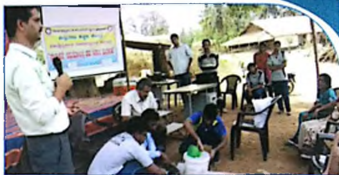
Demonstration of fodder enrichment to the farmers during NSS, Camp held at Yadawala Village of Shivamogga on 28-03-2016