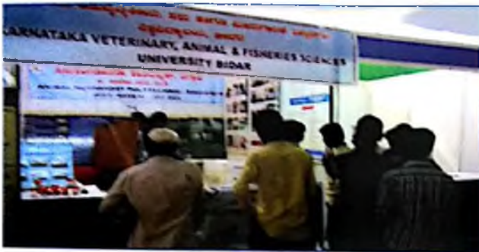
AHP Shiggaon Stall in Mela