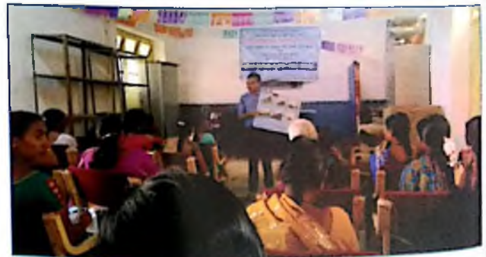
Dairy trg. Dec 15-1