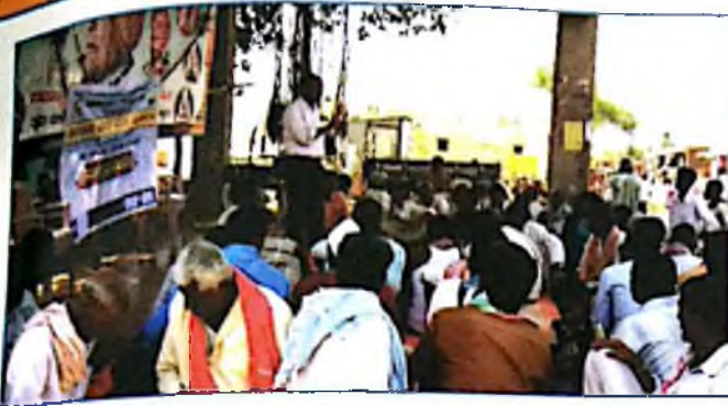
Awareness programme on Dry fodder enrichment Yelisoru