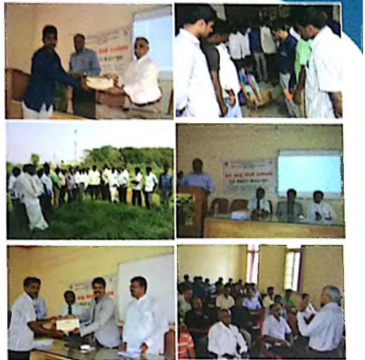
Glimpses of Sheep & Goat Trainings conducted at Veterinary College, Bengaluru

Department got sanctioned, an Extramural ICAR project entitled "Develop and Evaluate, Use of Mobile Applications for Livestock Farming: A New Generation Technology Transfer for Sustainable Livestock Production, 2015 – 2016" (one year project – 9.20 lakhs)