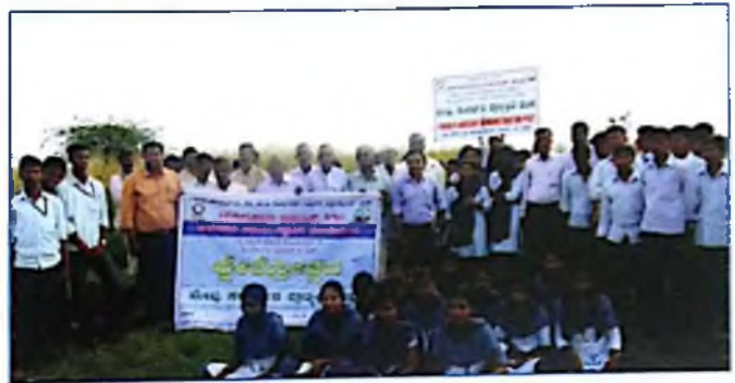
Fodder nursery field day at Menasgi