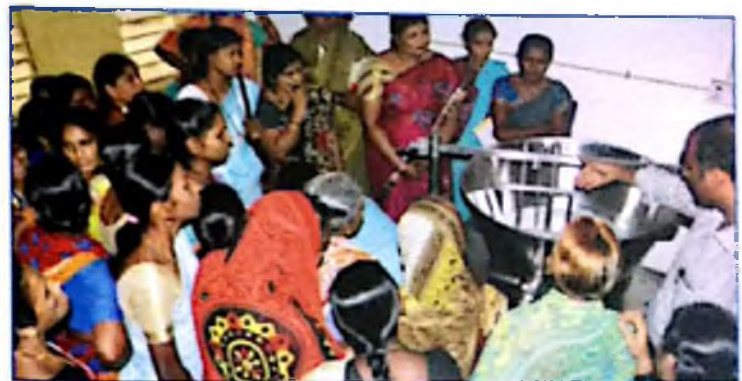
Training For Women was Conducted - AHPS