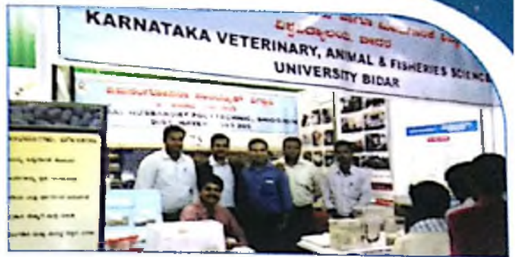
UHSB Horti mela (4)