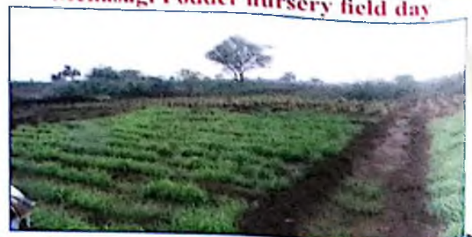
Menasagi Fodder nursery 20 days old