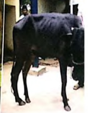
Post Operative Weight Bearing by Cow