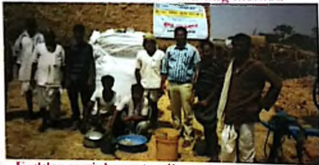
Fodder enrichment – direct feeding method