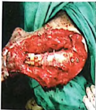
Tibial fracture, repair by IILN