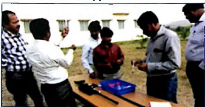
Participants practicing the loading syringe to use in dart gun or blow pipe.

Institute of Wildlife Veterinary Research, Doddaluvara conducted one-day workshop on "Chemical immobilization of wild animals" on 23 rd January, 2016 for the veterinary officers of AH & VS, Karnataka. The program was conducted to commemorate decenary year of KVAFSU, Bidar.