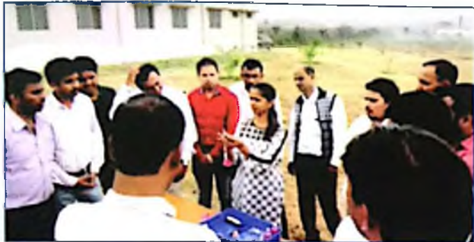
Demonstration of loading of syringe with drug to be used for dart gun/ blow pipe.

Institute of Wildlife Veterinary Research, Doddaluvara conducted one-day Training programme "Wild animal tranquilization" to the officers of Dept. of AH&VS on 22 nd January, 2016 for the veterinary officers of AH & VS, Karnataka. The program was conducted to commemorate decenary year of KVAFSU, Bidar.