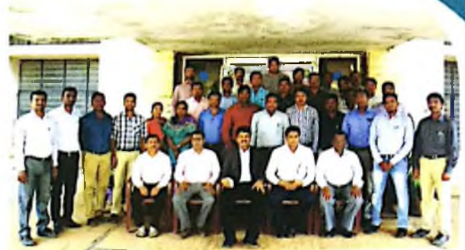
Group Photograph of 35 VO's Along with Dean & DE

□ The Directorate of Extension, KVAFSU, Bidar organized a National Level Fisheries Exhibition in collaboration with Department of Fisheries, Bengaluru and NFDB, Hyderabad at Mangaluru during 4 th To 6 th March, 2016.