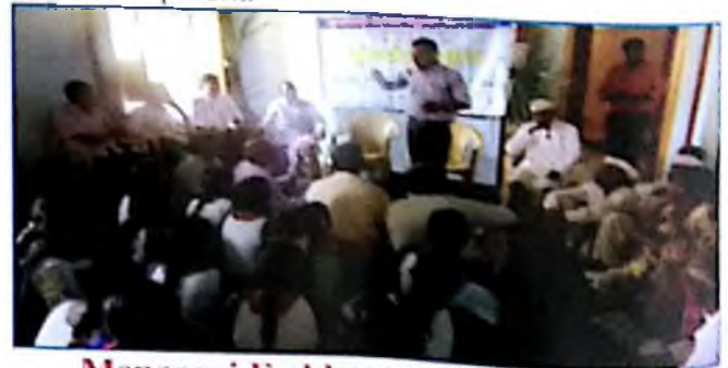
Menasagi Fodder nursery field day

Establishment of fodder nursery in rural areas helps in promoting rural entrepreneurship. Fodder nursery can also withstand uncertainty of nature's markets, diseases etc., were in risk of loss is minimum. Future this concept is a model for attracting rural youth towards agriculture there by promoting sustainable rural development.