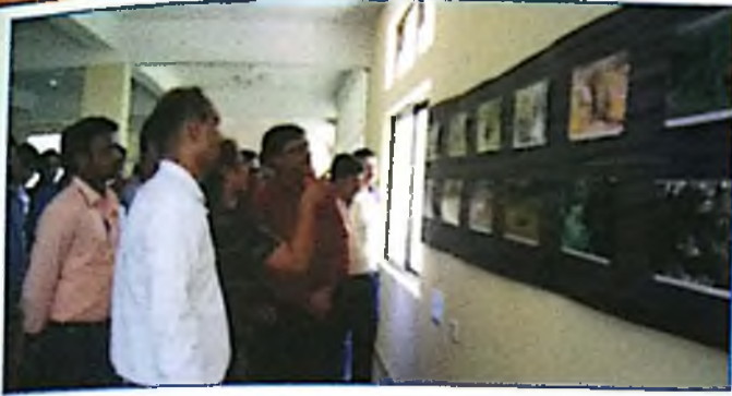
Appreciating the images of wild animals photographed in situ wildlife