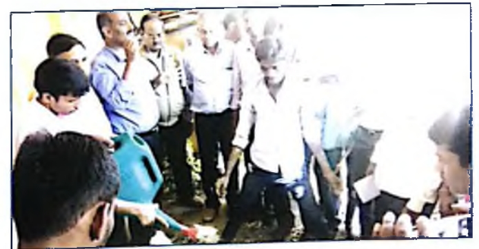
Fodder training 4 15.12.16