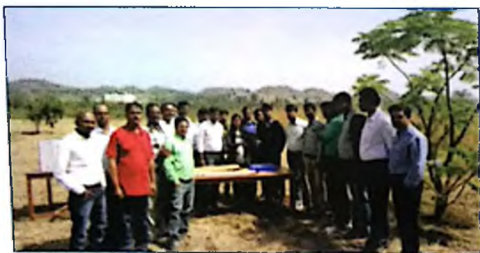
Demonstration of loading and handling of dart gun during the training programme on "Wild animal tranquilization"

Institute of Wildlife Veterinary Research, Doddaluvara conducted one-day Training programme on "Wild animal tranquilization" to the officers of Dept. of AH&VS on 8 th December, 2016 for the Veterinary Officers of Dept. of AH & VS, of Bengaluru Rural, Kalaburgi Kolar and Tumkur Districts of Karnataka.