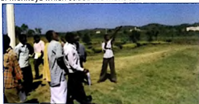
Demonstration on use of a repeller to chase Wild boars or Monkeys which cause menace.