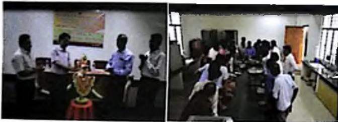
Demonstration on preparation of different milk products to the farmers.