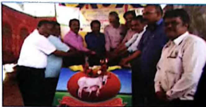
Inauguration of Amrithmahal Breeders Association by Director, Karnataka State Livestock Board and Joint Director, Dept of AH& VS