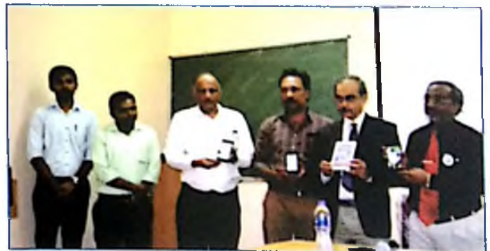
Mobile Fodder App was developed by Dept. of Veterinary Animal Husbandry and Extension Education, Veterinary College, Bengaluru was launched on World Veterinary Day-2016 at Veterinary College, Bengaluru