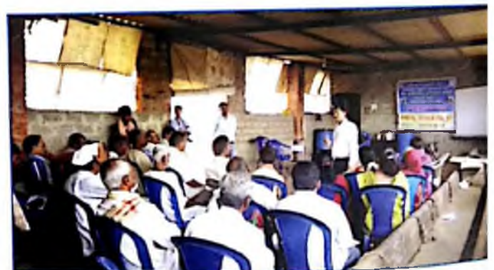
Silage making lecture