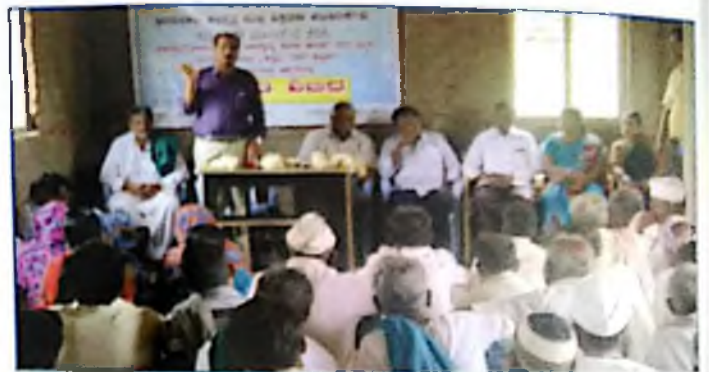
Awareness programme on Sub clinical mastitis- Beldadi