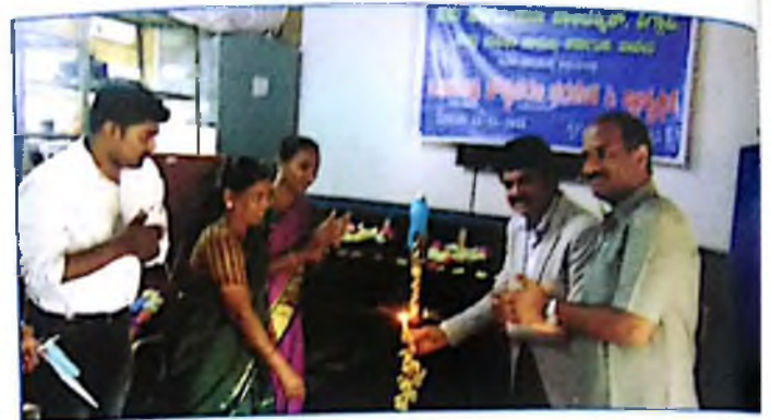
Training Fodder enrichment inauguration