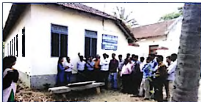
Explaining to the staff of Dept. of Forest on the use of restraining equipments in wildlife

Institute of Wildlife Veterinary Research, Doddaluvara conducted one day workshop on "Veterinary aspects of Wild animals" to the staff of Dept. of Forest, Kodagu District on 26-2-2016. The program was conducted to commemorate decenary year of KVAFSU, Bidar.