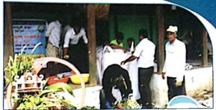
Demonstration of Silage- Sorturi