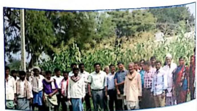
31-10-15 Field Day Fodder nursery Ranatur