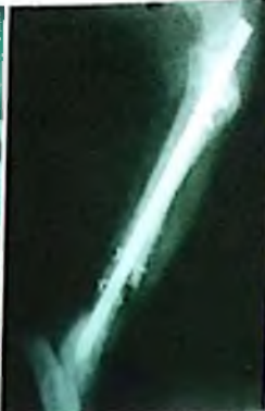
Radiograph - IILN in Situ