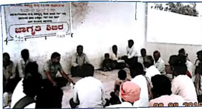
Awareness programme on Sub clinical mastitis- Shirol