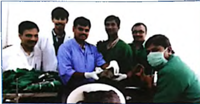
Surgical correction of shell fracture in a Tortoise at Veterinary College, Bengaluru