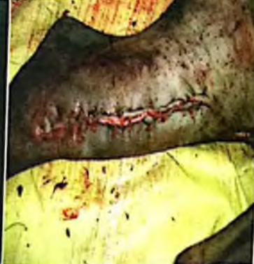
Post Operative Skin Closure