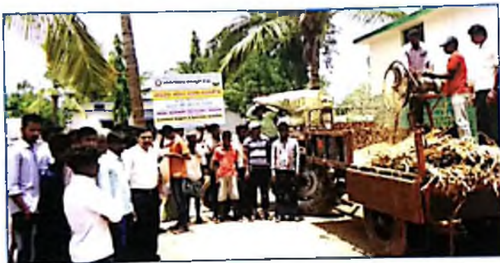
Demonstration on fodder chaffing Ranatur