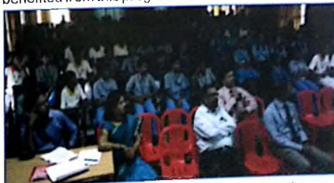
Educating the school children's on prevention and control of Zoonotic diseases by the Dean, Veterinary College, Bengaluru.

Awareness programme for UAS Campus School Children on Zoonotic Diseases as a part of World Zoonoses Day Celebration was organized at Veterinary College, Hebbal, Bengaluru on 31-08-2016. A total of 100 students were participated and got benefited from this programme.