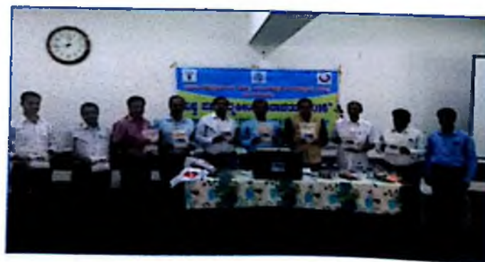
Releasing of cost effective mineral mixture for dairy animals on world veterinary day on 30 th April, 2016.

Department of LPM, Veterinary College, Shivamogga, organized short term one week training programme for entrepreneurs in poultry farming from 20-06-2016 to 25-06-2016 in association with CPDO, Hesaraghatta. Forty five farmers from the districts of shivamogga, Chikkamagalur and Davanagere participated in the training programme.