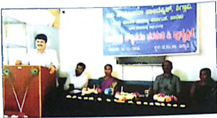
Training Fodder enrichment address