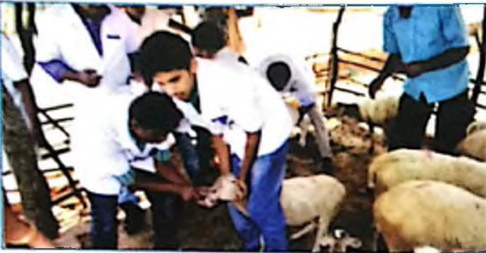
Animal Health Camp at Haniyuru by Veterinary College, Bengaluru