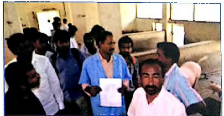
Training programmes on 'Pig farming' at Veterinary College, Bengaluru