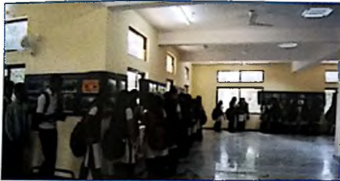
School children viewing the wild animal photographs Wildlife week Celebration 2016