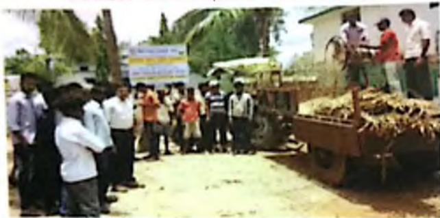
Fodder enrichment with bag method