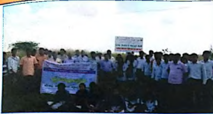
Menasagi Fodder nursery field day