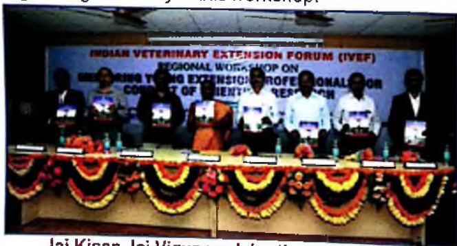
Jai Kisan Jai Vigyan celebration at Veterinary College, Hassan Jai Kisan Jai Vigyan celebration at Veterinary College, Hassan