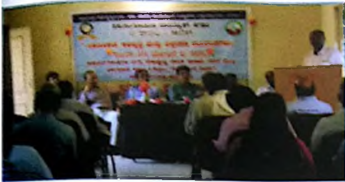
Work shop Gadag