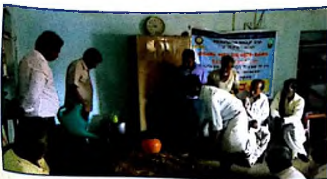
Demonstration Dry fodder enrichment Sorturi