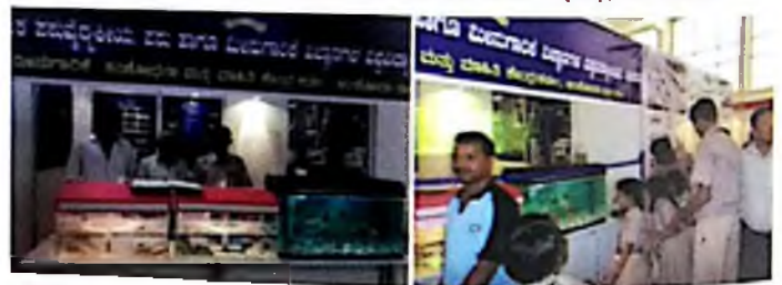
FRIC (M), Ankola Stall at National Mathsya mela -2016, Mangaluru (4-6 th March, 2016)