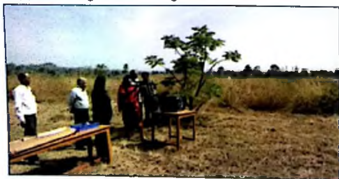
Participant aiming the dart gun to the target during the training programme "Wild animal tranquilization"

Institute of Wildlife Veterinary Research, Doddaluvara conducted one-day Training programme "Tranquilization of wild animals" to the officers of Dept. of AH&VS on 9 th December, 2016 for the Veterinary Officers of Dept. of AH & VS, of Haveri, Koppal, Yadagiri and Kodagu districts Karnataka.