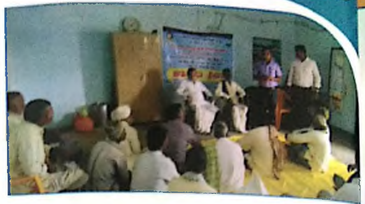
Awareness programme on Dry fodder enrichment Sortur