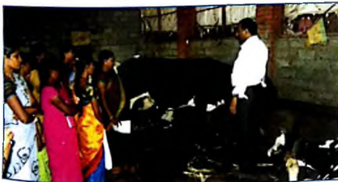
Dairy trg. Dec 15-3