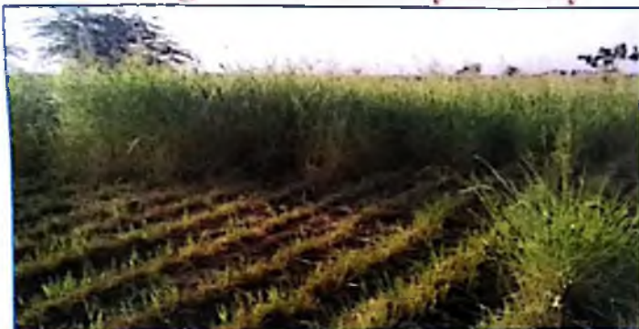
Menasagi Fodder nursery harvesting